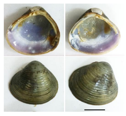
Figure 1: Photos of Corbicula fluminea . Scale bar: 1 mm.

Heavy metals in clam's tissues were extracted as previously reported by Yap et al. (2003) with minor modifications. Briefly, soft clams tissues were homogenized in 2 mL of concentrated nitric acid (75%). After sonication for 3 min, the samples were completely digested with 2 mL of the same solution for 12 h at 80°C. The digested samples were then centrifuged at 4000 rpm for 10 min under room temperature. The supernatant contained metals were kept at -20°C period to analysis.