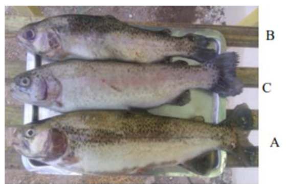
Figure 1: Color change of rainbow trout skin fed by safflower (A: 10% treatment, B: 15% treatment, C: 5% treatment).

Regarding skin discoloration, the results of Table 2 showed that statistically, the treatment of 10% safflower on the factors of redness, yellowing, and L * or skin brightness was significantly different from other treatments ( p \le 0.05 ) (Figs. 1 and 2). According to the results of Table 2, in relation to scarlet firethorn; fillet brightness index (L*), fillet red/green index (a*), Fillet yellow/blue index (b*), skin brightness index (L*), red/green skin index (a*) and yellow/blue index Skin (b*) was not affected by different treatments (p < 0.05).